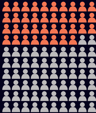
Public trust in the UK government (ONS, 2023)